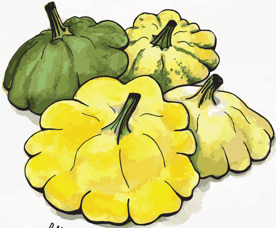
PATTY PAN SQUASH