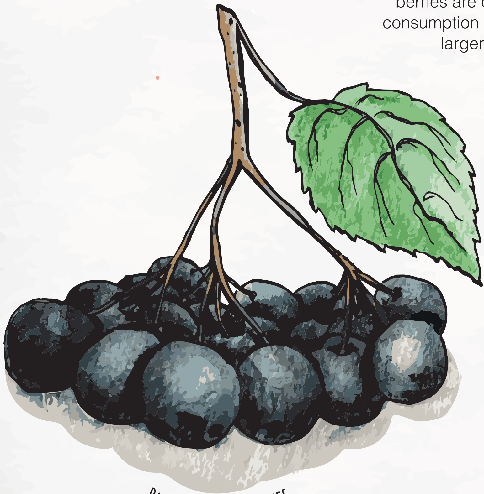
BLACK ARONIA BERRIES

There are two main species of aronia berries: black and red. Black aronia berries are commonly grown for consumption in Nebraska and bear larger fruit than red.