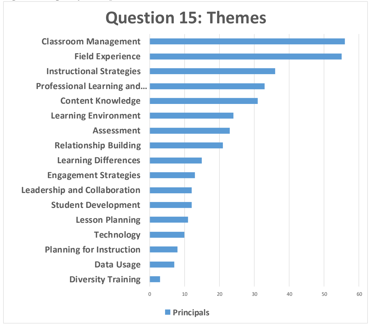
Figure 1. Frequency of Response Themes for Question 15