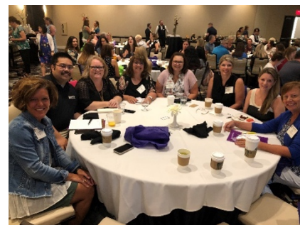
(Members of the NeMTSS Team and ESU #13 at Acadience Training in July.)

On behalf of the entire NeMTSS team, we wish you all a great start to your 2019-2020 school year!