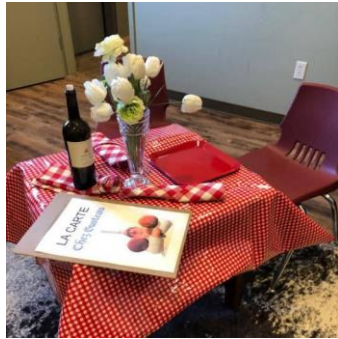
A French café scene, team banners, and a prize table