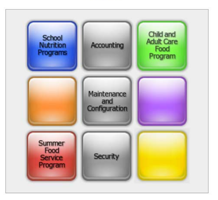
Figure 4: Programs Page