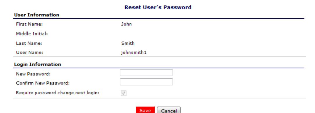
Figure 10: Reset User's Password screen