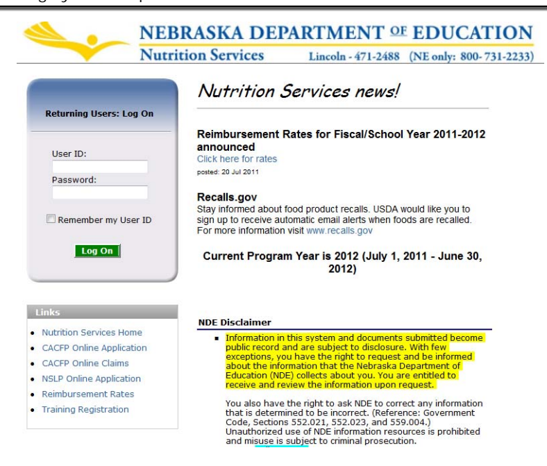
Figure 1: System Home Page

TIP: You can add this URL to your browser's FAVORITES list or create a shortcut to the web site on your desktop for quicker access to the site. Refer to your browser or operating system help files for further information.