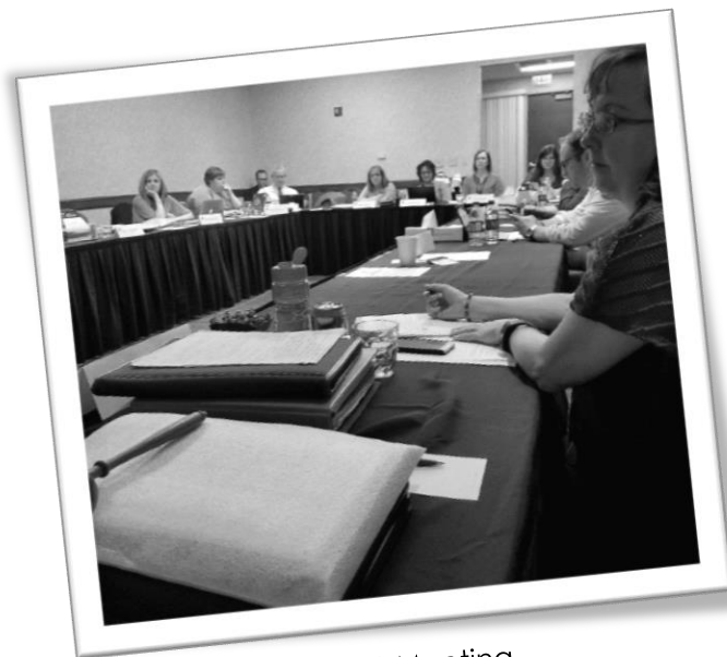
April 2018 Meeting