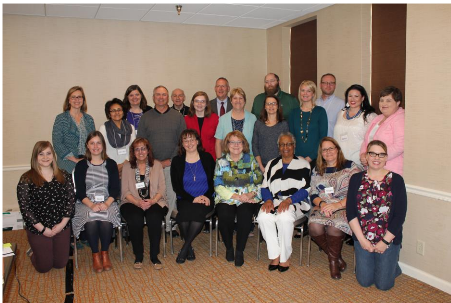
Special Education Advisory Council Members 2016-17

The responsibility of each Council member is to advise, (i.e. inform, counsel, recommend, suggest or guide) the Department of Education, not to advocate for individual issues. Recommendations are made by SEAC for the consideration and possible action by the NDE Special Education Office and the State Board.