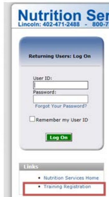
Figure 1. CNP log in and Training Registration