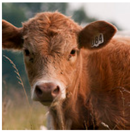
Feed cattle, Processing, Packing

Has anyone in your family worked in anything related to the jobs listed below? Yes No