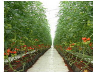
Greenhouse, Nursery, Sod