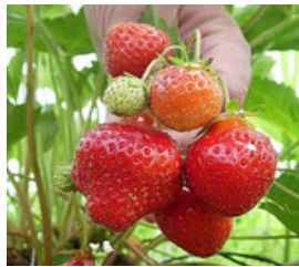
Harvest (fruit and vegetables)