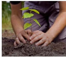
Trees- Planting, cutting