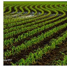
Cultivation, Preparation of soil